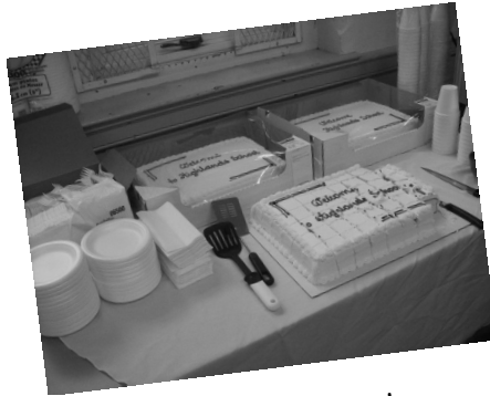
The cake . . .mmm!

The many new staff here at Highlands had a chance to chat with their students and parents in a relaxed atmosphere while filling up with hamburgers (including vegetarian), veggies, chips, juice, coffee and cake.