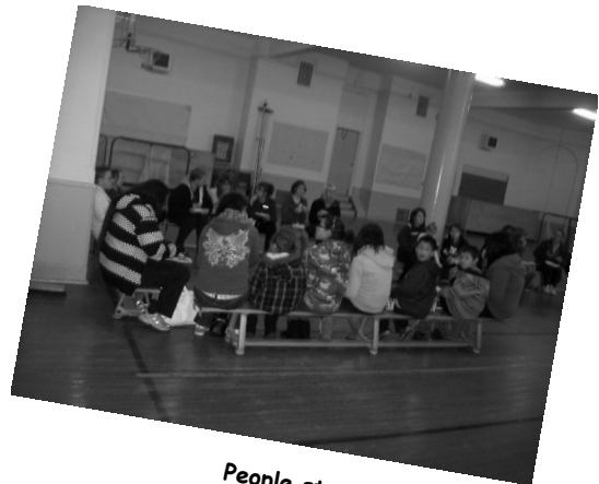
People starting to arrive.