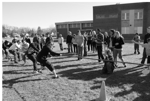
HOG Days Tug-a-war!